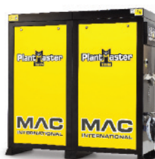
MAC TWIN PLANTMASTER