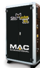
MAC SITEMASTER XL